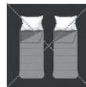
OPTIONAL GROUND TENT WHERE AVAILABLE